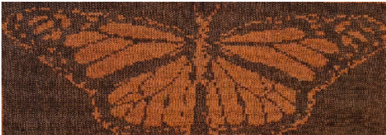
Bernadette Geuy Monarch